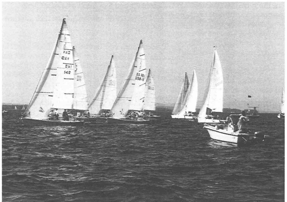
The J/80 fleet comes off the starting line at the 1998 J-Jamboree North. See story and more photos on page 5.